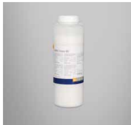
CEREC Stone BC (1200 g)