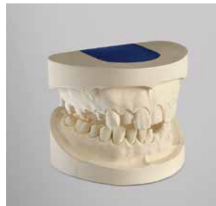
CEREC Stone BC Model