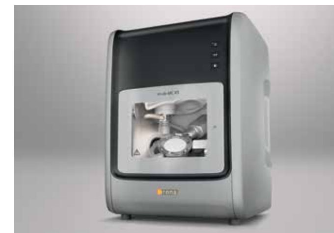
inLab MC X5