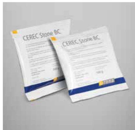
CEREC Stone BC (100 g)